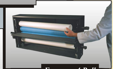
Economy 4 Roll