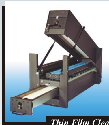
Thin Film Cleaner