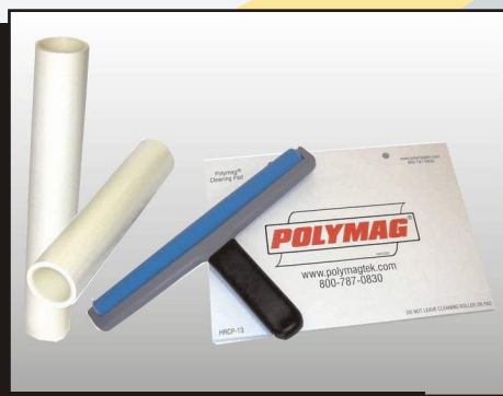
Adhesive Rolls & Hand Held Cleaning Rollers