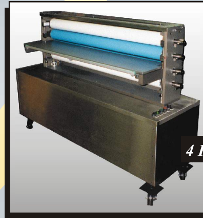
4 Roll Cleaner