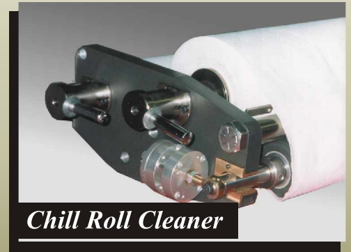
Chill Roll Cleaner