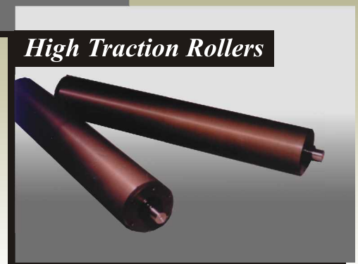
High Traction Rollers