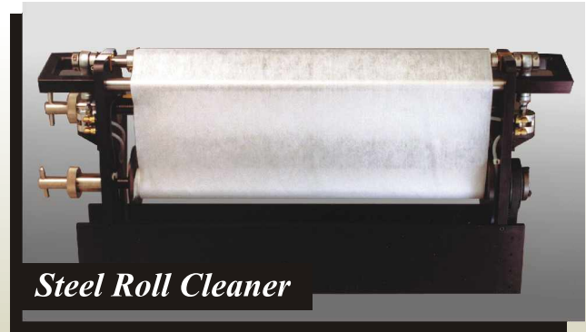
Steel Roll Cleaner