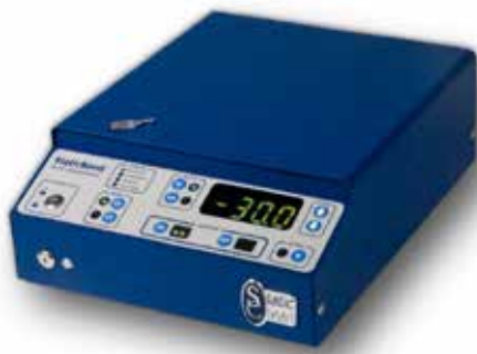
SB-30A (30kV) Charging Power Supply

Please see separate datasheets for charging equipment specifications etc.