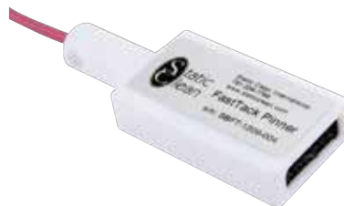
FastTack Charging Applicator

Please see separate datasheets for charging equipment specifications etc.