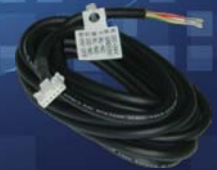
Power supply, signal cable (included)

Low-flow ionizer for gentle, efficient delivery of ionization